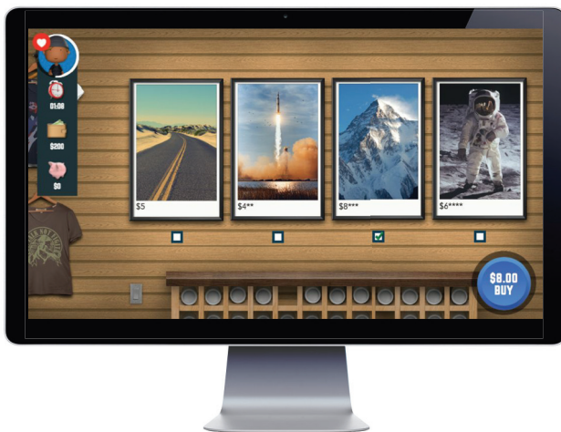
Paint, Posters, and a new Pad

Advise Me, Please! - There is no greater investment than the one you make in yourself. This is a lesson that should be learned early and often. For every student that feels the pressure to find a path after high school, this activity is a necessary release valve. In this activity, students learn about the many opportunities that exist beyond high school, from trade school to four year institutions.