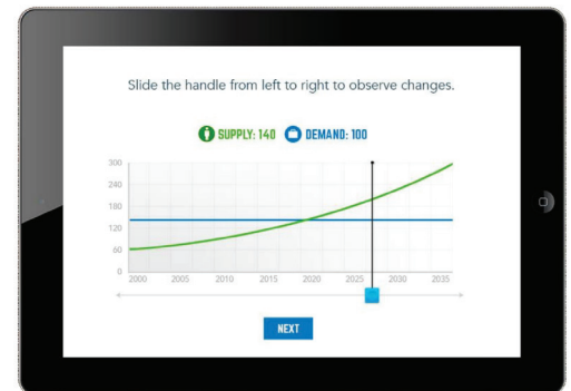
Supply and Demand Interactive Slider