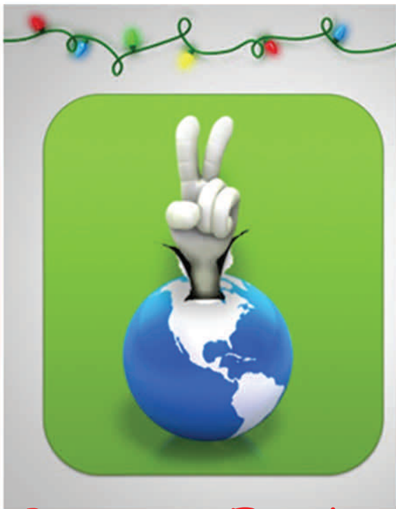
Peace on Earth