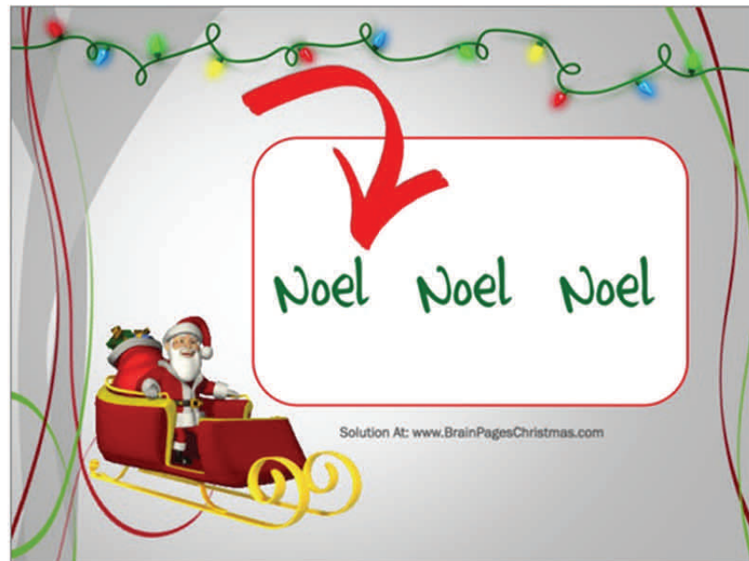
The First Noel