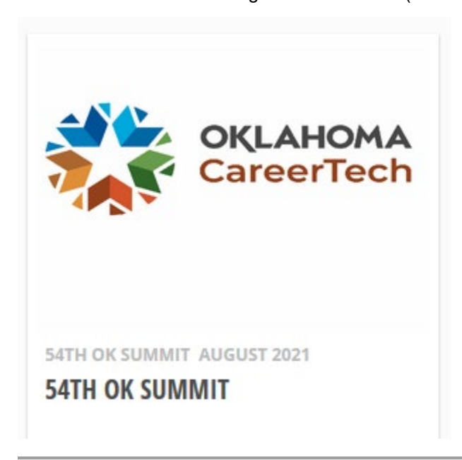
2021 OK Summit Participation

Select "54th OK Summit August 2021" course (see below).