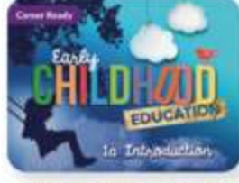
ECE: Pathway to National Credential