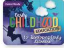
ECE: Pathway to National Credential