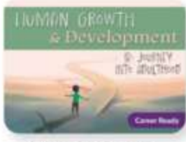
Human Growth and Development