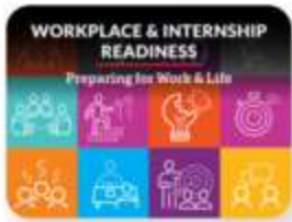
Leadership and Management / Career Orientation