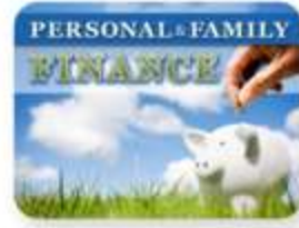
Personal Financial Literacy