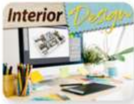
Interior Design I