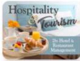
Hospitality and Tourism Management