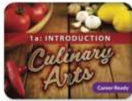
Culinary Basic Skills / Introduction to Culinary Arts