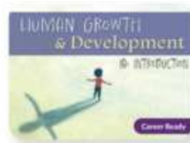
Human Growth and Development