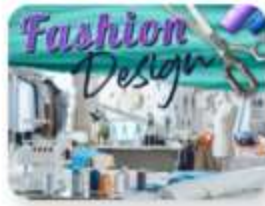
Fashion Design I