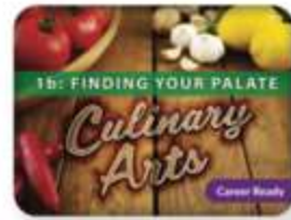
Culinary Advanced Skills / Introduction to Culinary Arts