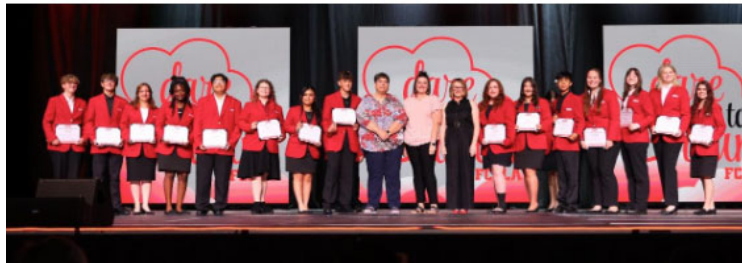
Students receiving scholarships on a stage

The 2026 FCCLA National Leadership Conference Scholarship offers $2,750 in attendance assistance to nationally affiliated FCCLA student members in grades 6–11 who have not previously attended NLC. The need-based scholarship supports students attending the conference in Washington, DC and requires applicants to demonstrate financial need, leadership, community involvement, and FCCLA participation. Applications are due February 20, 2026, with recipients announced in late April 2026.