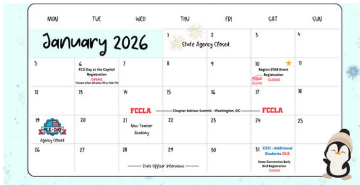
January 2026 calendar