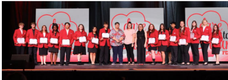
Students receiving scholarships on a stage

The 2026 FCCLA National Leadership Conference Scholarship offers $2,750 in attendance assistance to nationally affiliated FCCLA student members in grades 6–11 who have not previously attended NLC. The need-based scholarship supports students attending the conference in Washington, DC and requires applicants to demonstrate financial need, leadership, community involvement, and FCCLA participation. Applications are due February 20, 2026, with recipients announced in late April 2026.