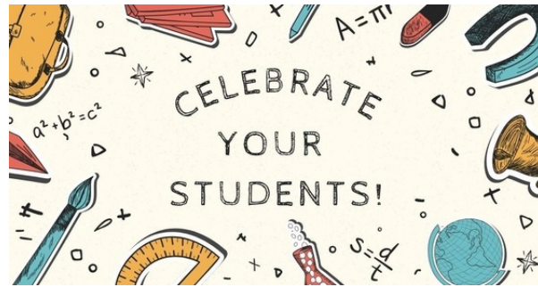
Celebrate your students! banner