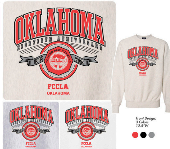
Example of design

Below is a photo of the commemorative 80 th anniversary t-shirt